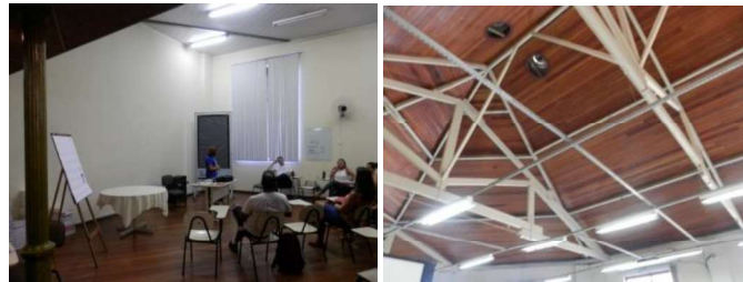
Figure 6: Teacher training centre, sign language class, opening on the second floor to the air vents. Air conditioning is provided in the reconstruction of the building.