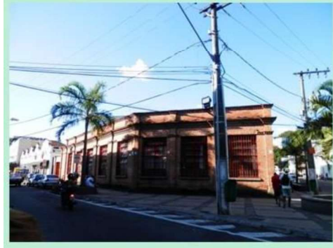
Figure 5: Dr. Geraldo Moutinho Centre of Education of Youth and Adults (CEM).