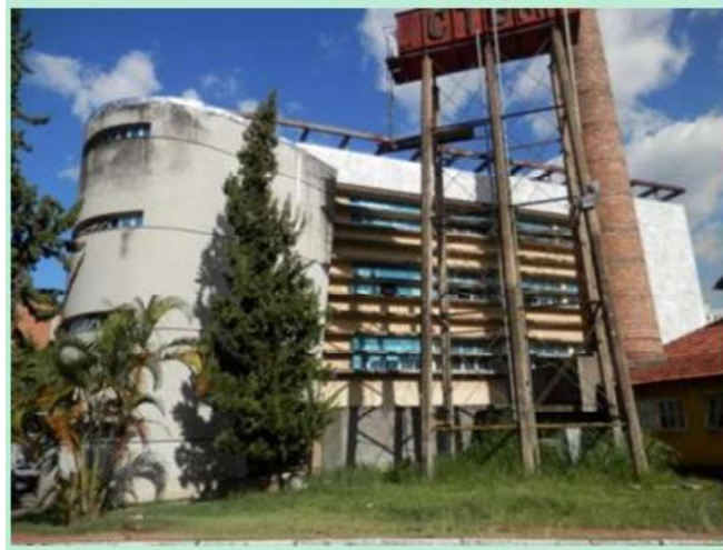
Figure 7: Murilo Mendes Municipal Library.

A building with three floors and an area that totalizes 2104 yards square, the library was built by the City Hall of Juiz de Fora in partnership with the Ministry of Culture. It is divided into five sectors, namely the memory sectors, Braille, loans, periodicals, children's and reference sector, with a collection of about 80,000 volumes (FUNALFA 2016). It was inaugurated in 1996 and was designed to facilitate the transit of people with special needs (see Figures 1 and 7).