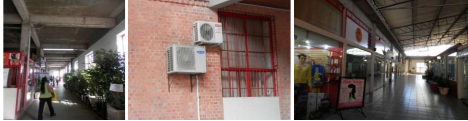
Figure 4: Ground Floor of the Municipal Market, with windows and a circulation corridor, improvised thermal conditioners installed on the facade of the building, facilities for sales stands of concrete and masonry, with a roof of metal structure, hollow elements and systems of air exchange.

Table 2 shows the clarifications about the survey that has been conducted. It was put in evidence in the survey the employment of the internal steel structure of support. Besides the masonry of solid bricks, it were also adopted in the reconstruction some characteristics that allow the adaptation of the space to the new proposed utilizations, such as double height ceilings, ceiling vents and ceiling atrium for smoke exhaust and, finally, the construction of stairs for safer access.