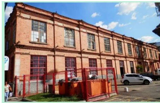
Figure 3: Municipal Market and the Municipal Secretary of Education.

Municipal Market is the name given to the building that contains the market since 1987, as well as the Municipal Secretary of Education. This building is the result of a reconstruction, after the fire that occurred in 1991. Composed by two floors, follows the same constructive guidance of the British manufacturing models, with apparent solid bricks possessing ornamentation in the intermediate and superior entablature. The solid bricks are arranged in zigzag, with indentations and protrusions (FUNALFA, 2015), as it can be seen in Figures 3 and 4.