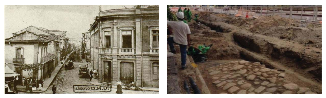
Figure 1. (Left) - Ajuda street at the beginning of the 20<sup>th</sup> century with sidewalks in granite stones; (right) - Stone sidewalk in "pé-de-moleque" style on Rio Branco avenue, Rio de Janeiro.

Pavements for pedestrians were object of attention of government since the 17th century, when cities still had no motor vehicles. In the city of Rio de Janeiro, capital of the Brazilian empire, "in 1870, a new urban structure was in process, in total harmony with transportation; the city expanded due to the capacity of the transport network to ensure transportation of the population" (Silva, 2008). Figure 1 exhibits the granite sidewalks of Ajuda street, in the proximities of the municipal theater of Rio de Janeiro, in the early 20th century. They offered good comfort and safety conditions even for current demand levels. This example represents a significant advancement in pedestrian infrastructure in comparison to pavements that still prevailed at the time, as the "pé-de-moleque" (boy's-foot, a Brazilian candy made with crunched peanuts) that emerged in colonial times, still present in neighborhoods of Rio de Janeiro and other historical cities of Brazil. Figure 1 also shows a segment in "pé de moleque" on the current Rio Branco avenue, discovered in 2015 upon construction of the light rail vehicle (VLT).